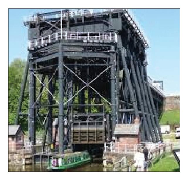
Anderton Boat Lift, between the River Weaver and the Trent and Mersey Canal