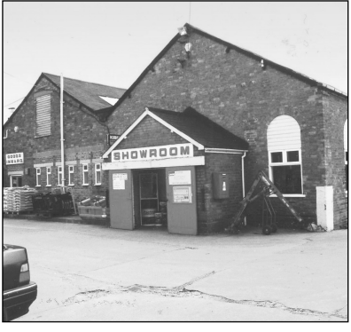
Left: a Barrows & Carmichael portable engine Right: Barrows and Carmichael works (now Burgess)