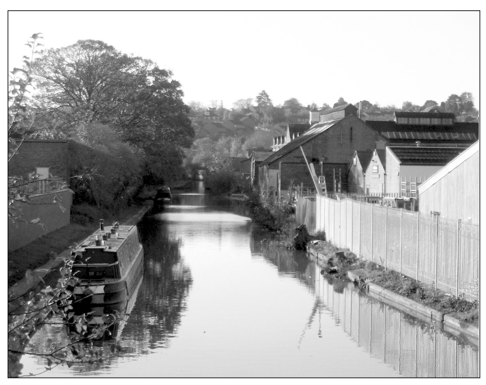
The Oxford Canal south of the bridge

The first part of the workshop comprised a presentation by CDC's master-planning consultants, LDA Design, who summarised recent progress and changes in thinking resulting from the current economic slowdown, the bursting of the buy-to-let bubble and remaining uncertainties about potential flood risk. This was followed by the unveiling of the 2008 masterplan for the Site, which we were told was provisional, as it did not yet