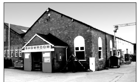
The former 'Burgess' premises on Canal Street is locally-listed and now included in the Oxford Canal Conservation Area. The buildings were originally used for erecting stationary and portable steam engines by Victorian agricultural engineers Barrows & Stewart. These buildings will provide the first test for the conservation area as, four days after the area was designated, an application to demolish the erecting shop was deposited with CDC. The Society will do all it can to persuade the Council to refuse the application.