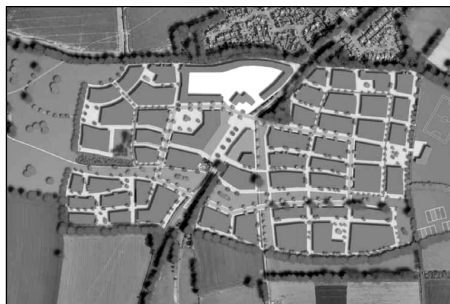
Ambitious plans for the area south of Saltway straddling the A361 shown on the developer's web site

As a relatively small development of 145 homes, the appeal proposal may not seem large. It nevertheless breaks the long-established principle, upheld at previous Inquiries, that Banbury should not extend beyond Salt Way and the town's natural bowl. It is apparent that the applicant's ambitions for the site extend well beyond the 145 homes proposed. Their website is currently advertising '160 acres to the south of Banbury, dissected by the A361'. The site is described thus: 'The site has potential for 895 dwellings and represents the gateway to a larger site to the south which is being promoted for up to 2,000 houses. We intend to submit an application in the near future.' The appeal application thus represents the tip of an iceberg that could, if successful, lead to further hostile, speculative applications for up to a further 2,750 homes, pushing the bounds of Banbury from the Salt Way (part of the Banbury Fringe Circular Walk) to Wykham Lane, in the process subsuming nearly a mile of the Salt Way and the surrounding countryside in unsustainable suburban sprawl.