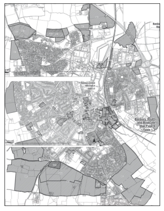
The future shape of Banbury? The shaded areas are suggested for development by Cherwell. This illustration was assembled from the maps provided.

The most recent stage in the ongoing saga of the forthcoming replacement of the Cherwell Local Plan has involved a consultation on the Banbury and North Cherwell Site Allocations Development Plan Document. This document